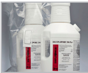
Sterile 70% IPA