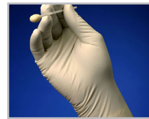
Sterile & Non-Sterile Gloves